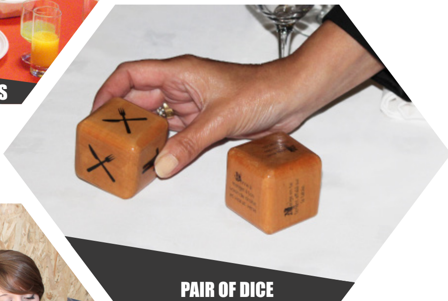
PAIR OF DICE

Perform the challenges indicated on the dice by doing all that is forbidden while at the table.