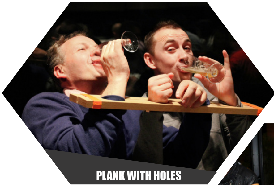
PLANK WITH HOLES

With your wrists linked to your partner's by a plank with holes , cooperate to finish your plates first and be the most efficient team.