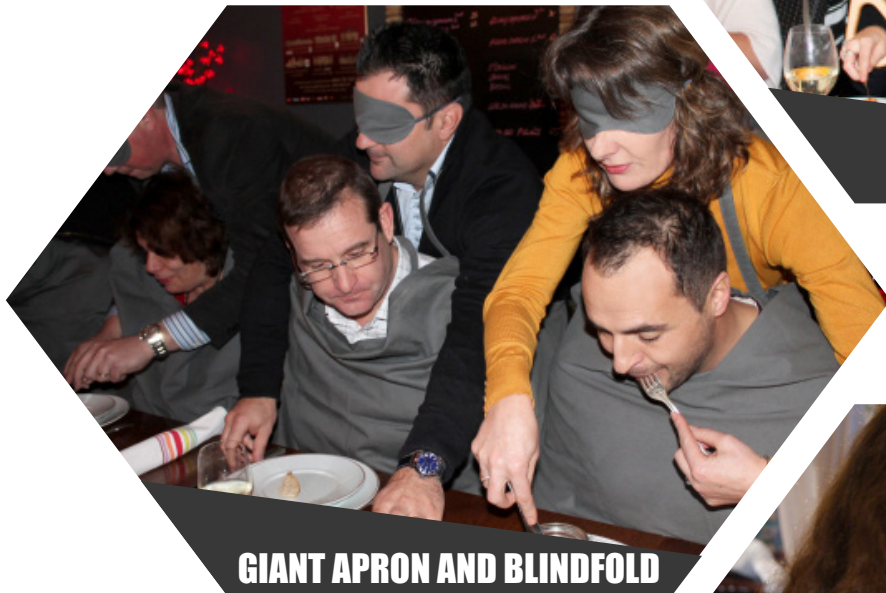
GIANT APRON AND BLINDFOLD

Equipped with a giant apron , combine your efforts to eat. One of you can't use your hands and the other one is blindfolded .