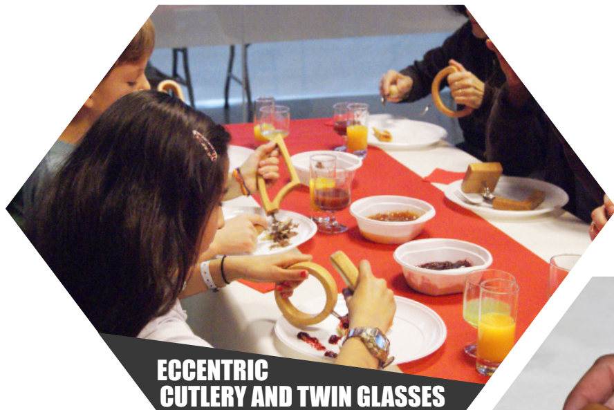
ECCENTRIC CUTLERY AND TWIN GLASSES

Perform the challenges indicated on the dice by doing all that is forbidden while at the table.