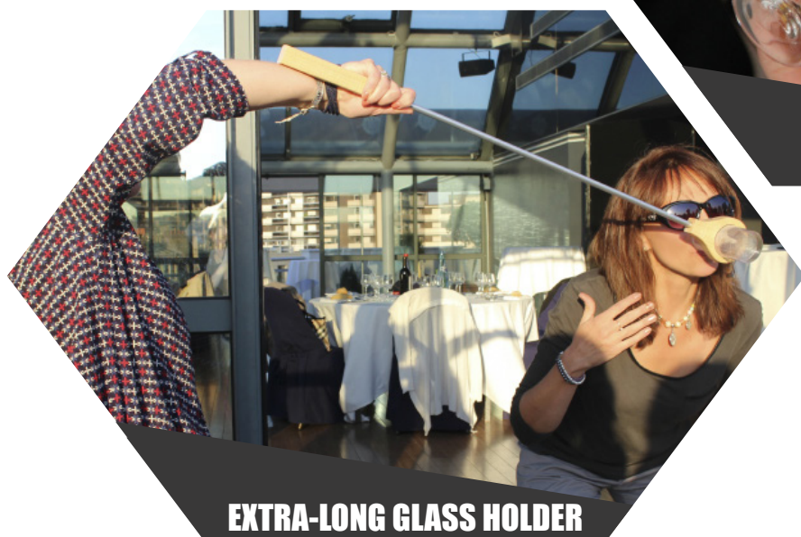
EXTRA-LONG GLASS HOLDER

Eat with eccentric cutlery and find the proper technique to drink with twin glasses .